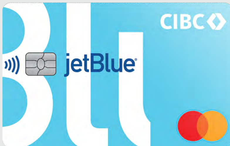
JetBlue Standard Card by CIBC Caribbean