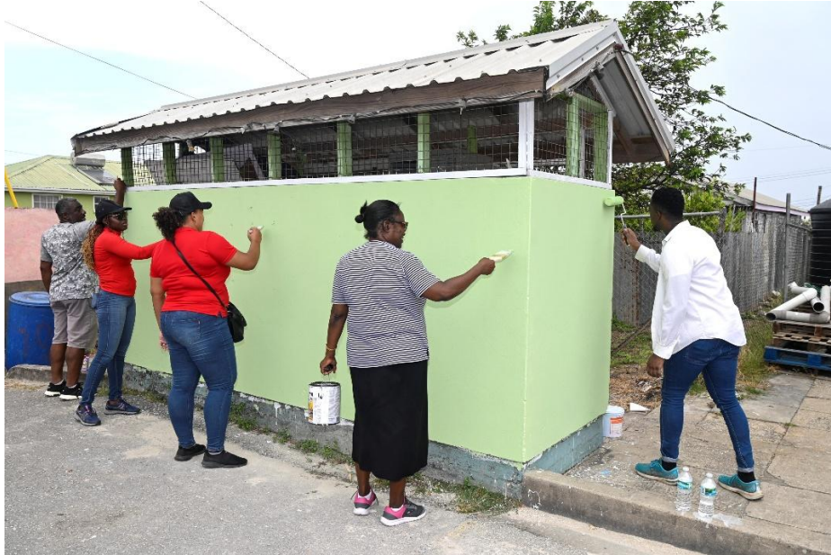
Part of the audit team painting the 4H storage shed.